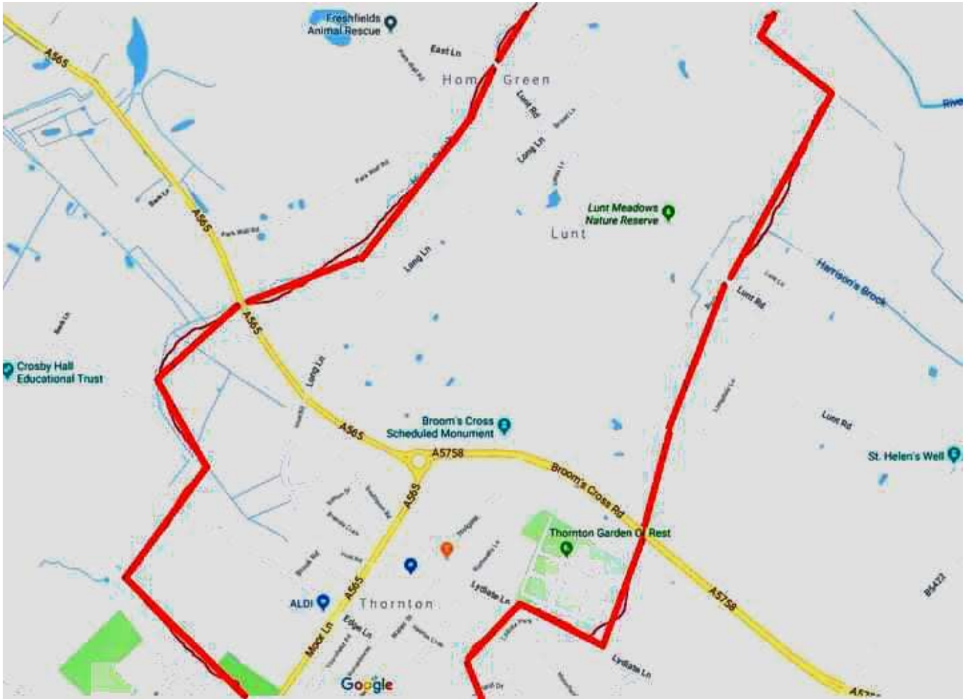
THORNTON "NORTH" map