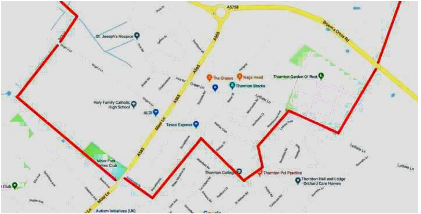
THORNTON "SOUTH" map